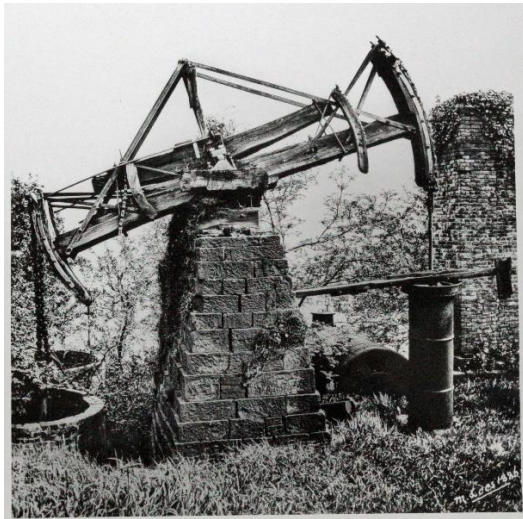
Fairbottom's Bob before removal to USA